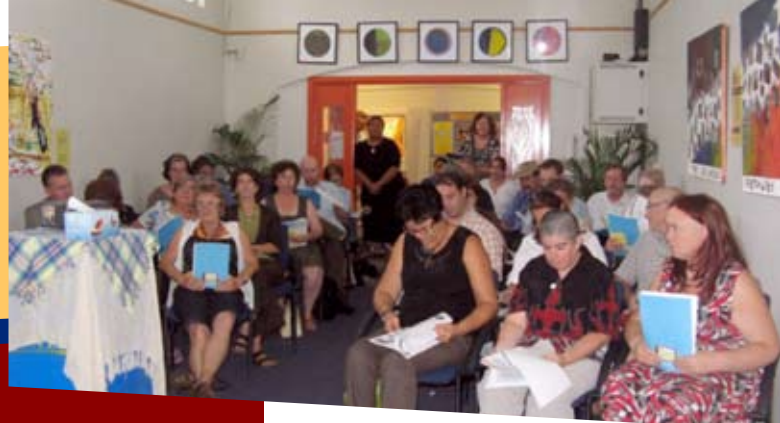
MHACA members getting ready for creative staff presentations followed by some hearty competition for committee elections

MHACA proudly celebrated a busy past year with a well-attended AGM on 5 November 2008. Approximately 40 people attended, demonstrating an ongoing commitment from the community and inspiring us all to 'keep striving'. The creative presentations show-cased in pictures much of what we've set out to achieve, a tribute to the hard work of all the staff and committee members. It was particularly encouraging to see strong interest for the committee elections, and we are delighted to welcome on board several new dedicated skilled members, as well as welcome the return of many of the previous members of the committee.