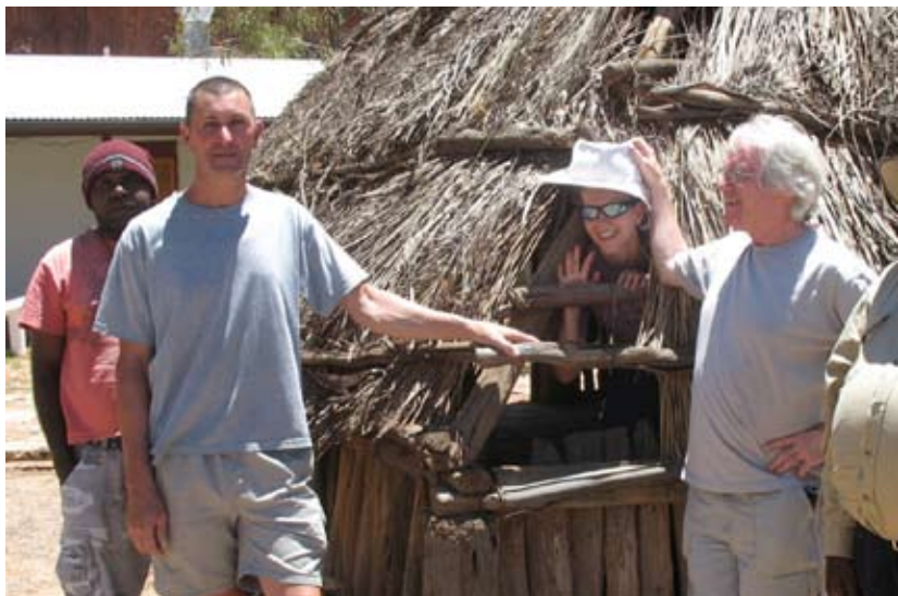
Another enjoyable day out at Glen Helen Gorge