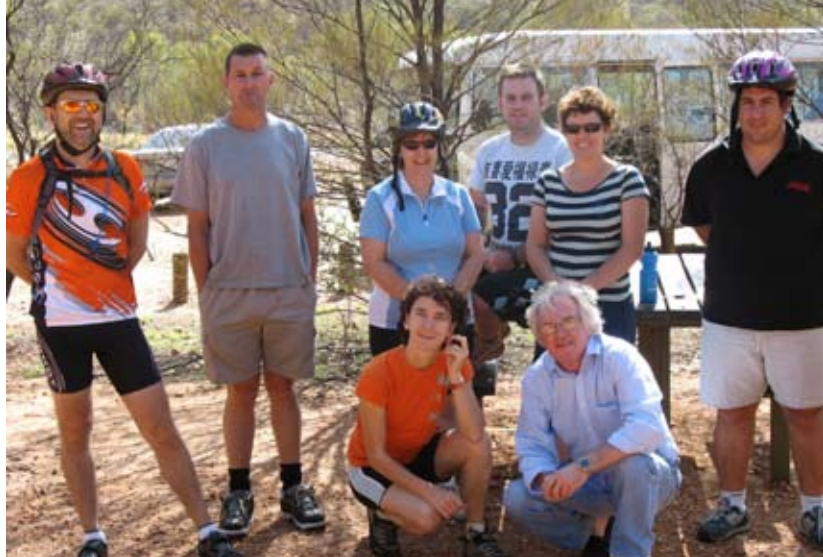
A well-earned rest stop on the ride to Simpsons Gap

was available with a short video based on stories from the men and women from Utopia, Central Australia. Our tour concluded at 12.30pm - just in time for lunch!