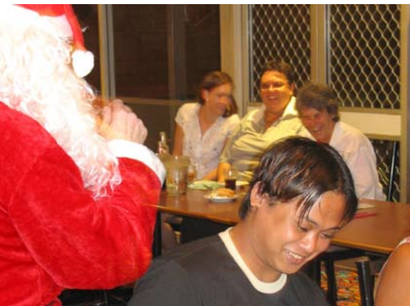
Santa makes a fleeting visit at the MHACA Christmas dinner

At Arltunga the Visitors Centre provided an insight into the history of this first Central Australian town born out of a gold rush in 1886-87;