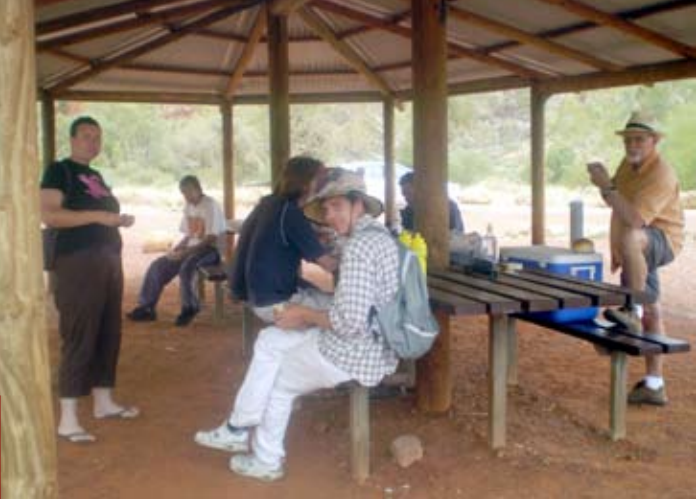
Left: Stopping for lunch on the trip to Ellery Waterhole in early January