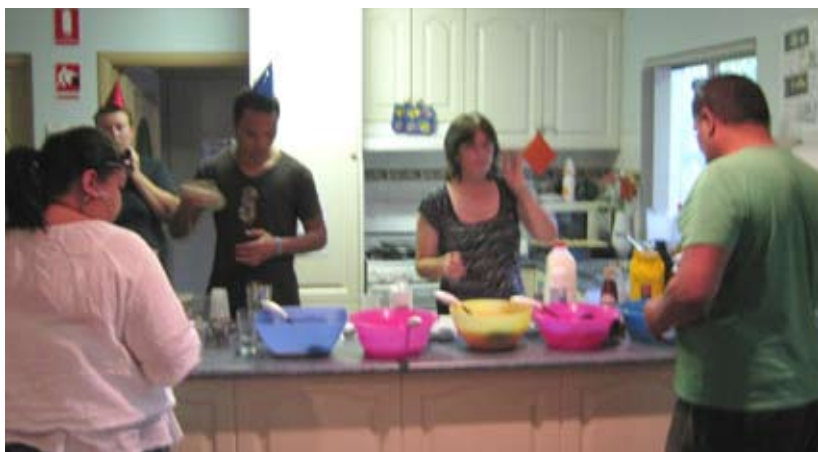
Left: Everyone chipped in to help prepare for the Mocktail Karaoke evening on 16 January