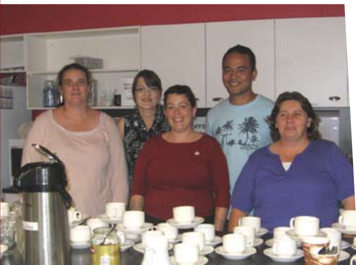
Above: Participants & staff helping out at the launch of Suicide Story at the Alice Springs Town Council on Wednesday, 3 March 2010