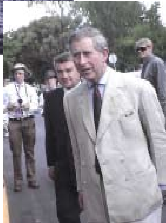
"Oh, I say good chap!"

Wait a minute ... but it can't be!!! Yes, it's England's own bonnie Prince Charles paying the locals a visit.